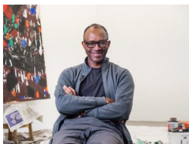
by Emeka Udemba